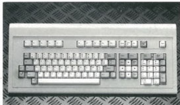
KEYBOARD KB5151 FULL COMPATIBLE.

standard keytronic type keyboard KB5050 or KB5151 professional, detachable, low profile, din plug azerty or qwerty