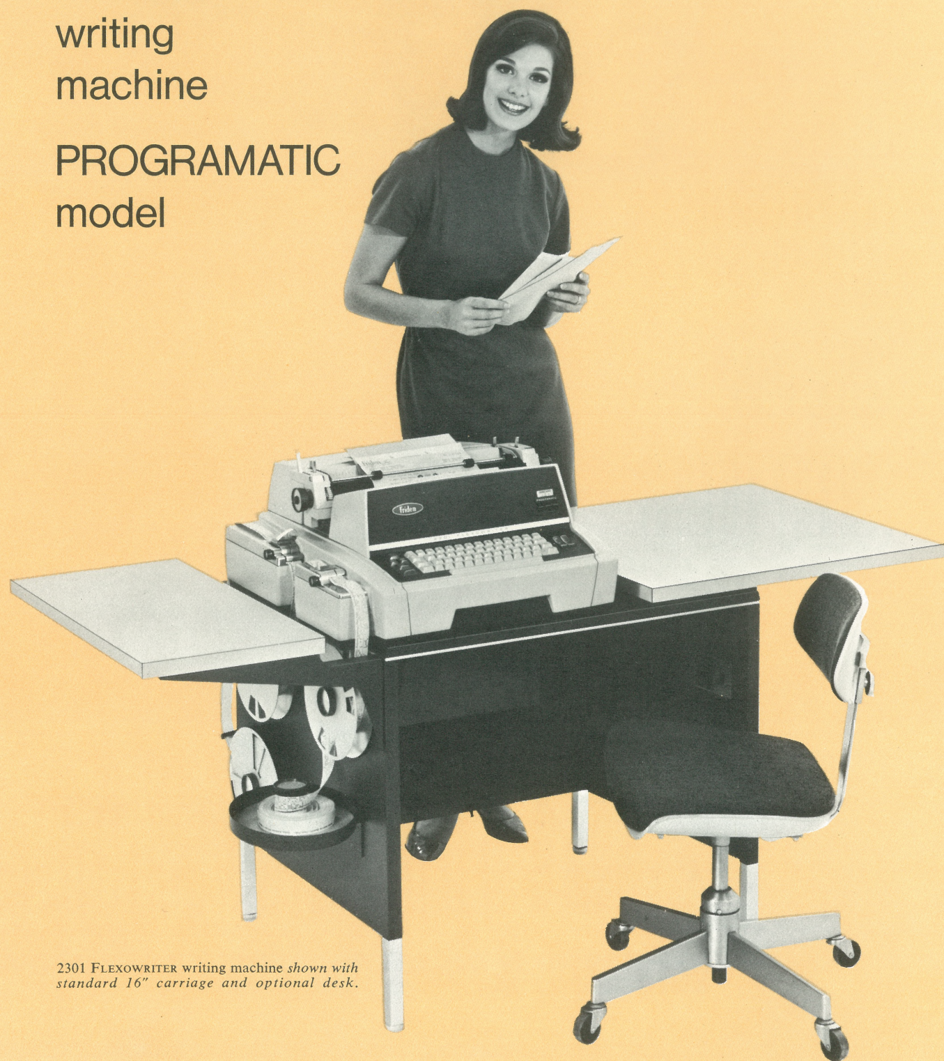
2301 FLEXOWRITER writing machine shown with standard 16" carriage and optional desk.

The 2301 FLEXOWRITER automatic writing machine, PROGRAMATIC* model, is the most sophisticated model in a great new series of FRIDEN* writing units. It is a stylish, versatile, high-speed electric writing machine capable of performing a variety of complex paperwork tasks—automatically.